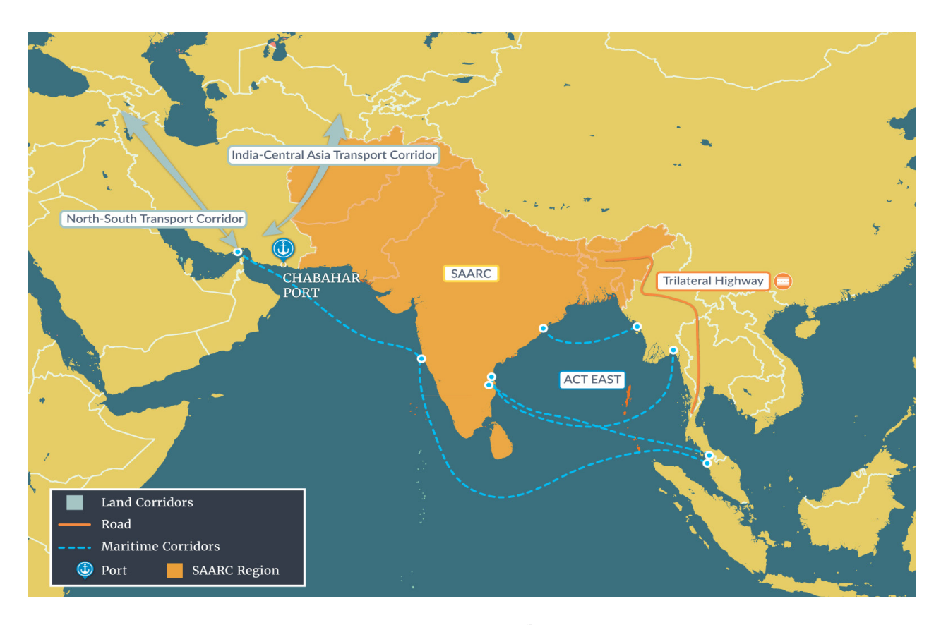
Map 2: India's approach to connectivity in its neighborhood<sup>43</sup>

circumvent SAARC, which has made little progress on regional integration due to the India-Pakistan rivalry. Since BIMSTEC does not include Pakistan as a member, it was pushed by India as an alternative at the side-lines of the 2016 BRICS summit in Goa and taken up enthusiastically by member states. Connectivity projects under BIMSTEC will include building road, rail, and port links connecting India, Bangladesh, Myanmar, and Thailand. Indian investments within the project have remained small, for instance it invested $ 224 million in Myanmar in 2015-16, a small number compared to China's $3.3 billion investments. A free trade agreement is also being negotiated between BIMSTEC countries. Similarly, the BBIN is a $1 billion project to improve road connectivity between Bangladesh, Bhutan, India, and Nepal.<sup>42</sup>